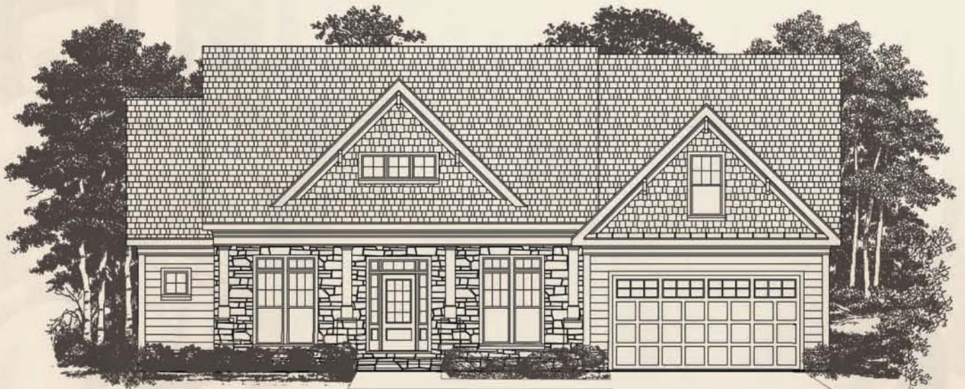
Elevation "A" with Stone Veneer

All sizes and dimensions are approximate. All features, design and prices are subject to change without notice. Floor plans may vary with selected elevations. Cut Sheets and or Brochures are only to be used to indicate locations of upgrades, their purpose is for marketing representation only. 12/08.